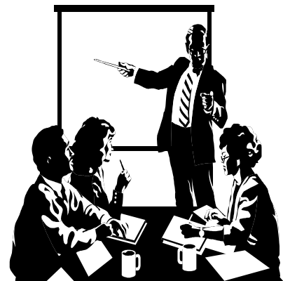
MEETING IN IS: