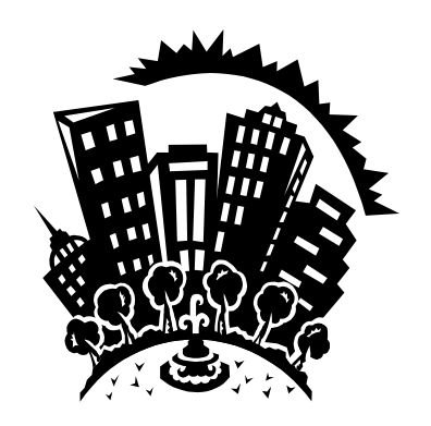
Shows season start in 125 days. Are you ready??